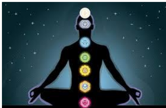
Diagram 1.0 The 7 Chakras

The chakra system is like interconnecting pools of spiraling energy that occur at various points along a stream of energy. This stream or river extends from the Earth, up through our physical